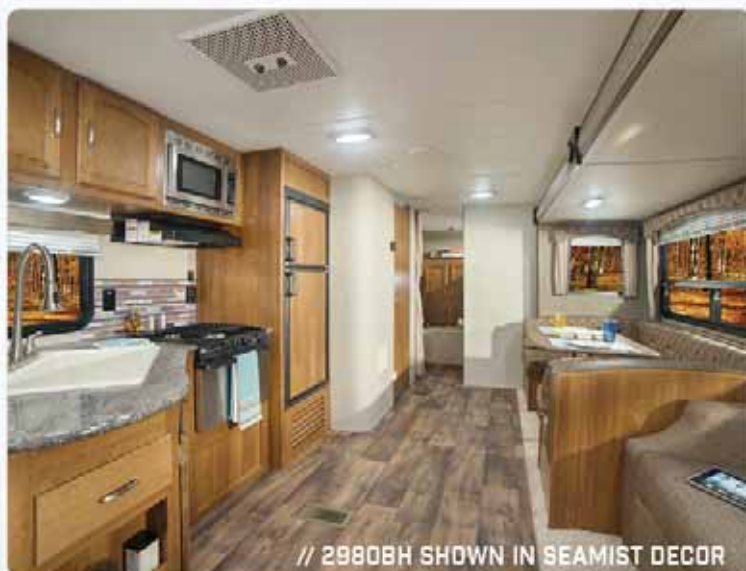
// 2980BH SHOWN IN SEAMIST DECOR