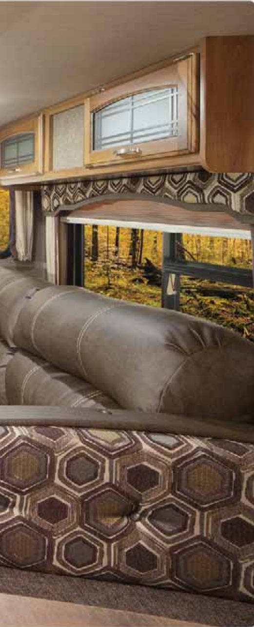
// 311RE BEDROOM