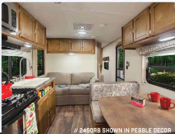
// 2450RB SHOWN IN PEBBLE DECOR