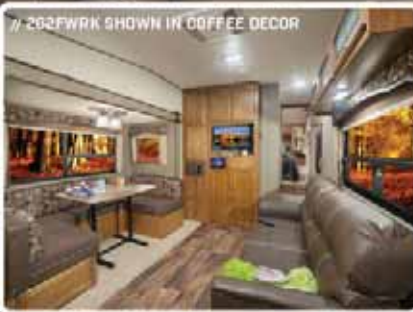
// 262FWRK SHOWN IN COFFEE DECOR