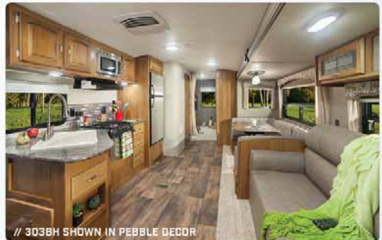
// 303BH SHOWN IN PEBBLE DECOR