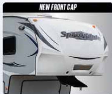
NEW FRONT CAP

50 AMP SERVICE • HEATED / ENCLOSED UNDERBELLY • LAMINATED SIDEWALLS