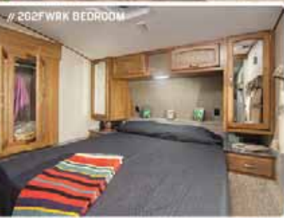
// 262FWRK BEDROOM