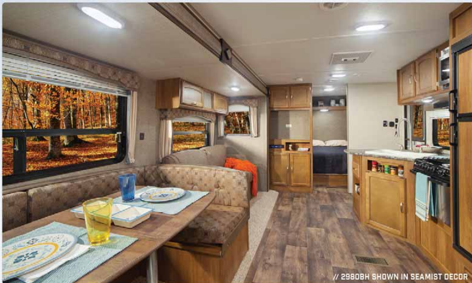
// 2980BH SHOWN IN SEAMIST DECOR