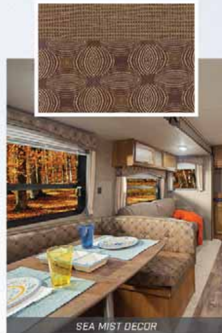
SEA MIST DECOR