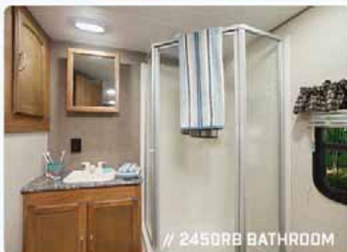
// 2450RB BATHROOM