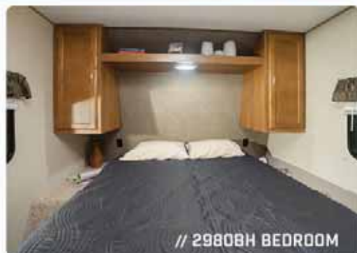
// 2980BH BEDROOM