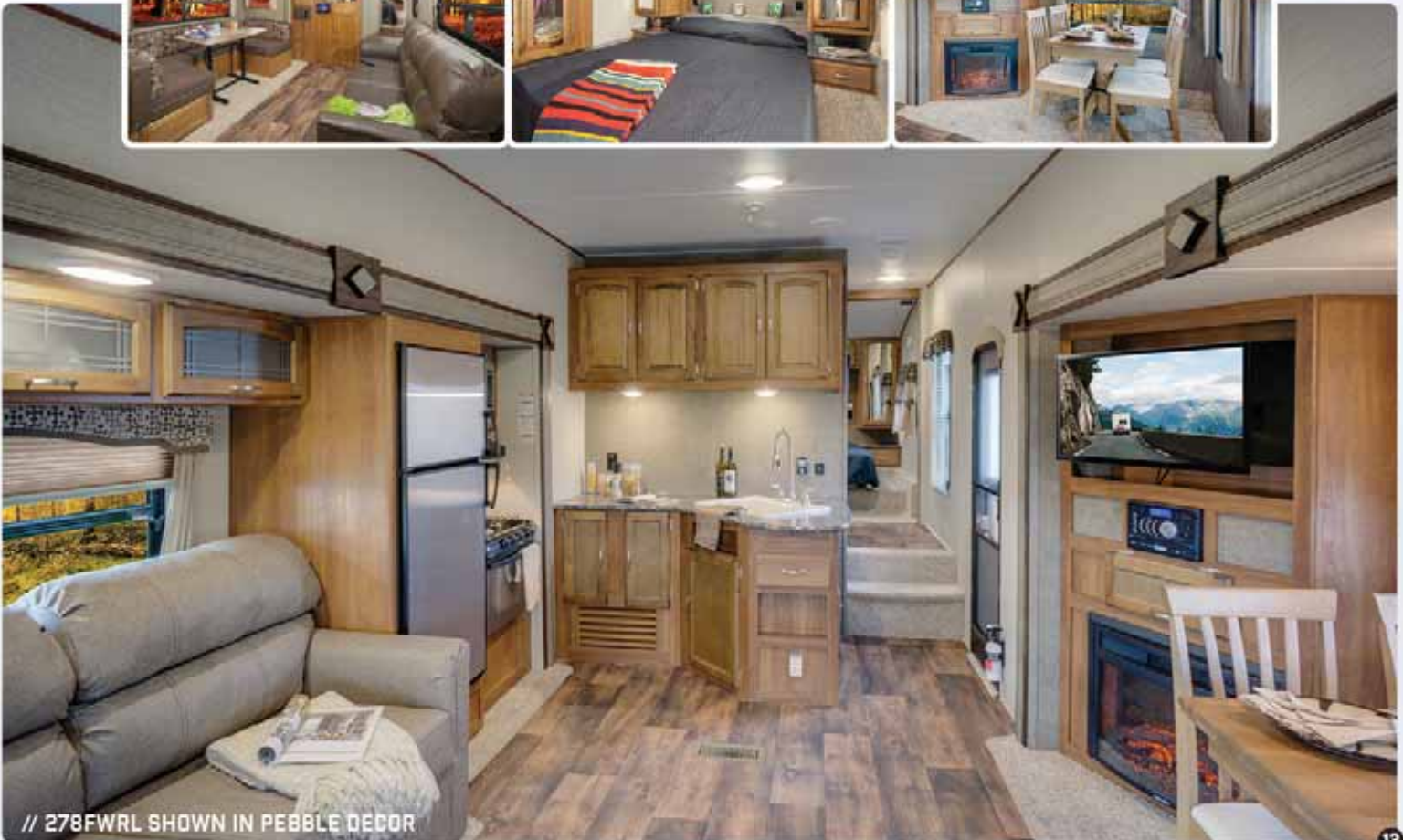
// 278FWRL SHOWN IN PEBBLE DECOR