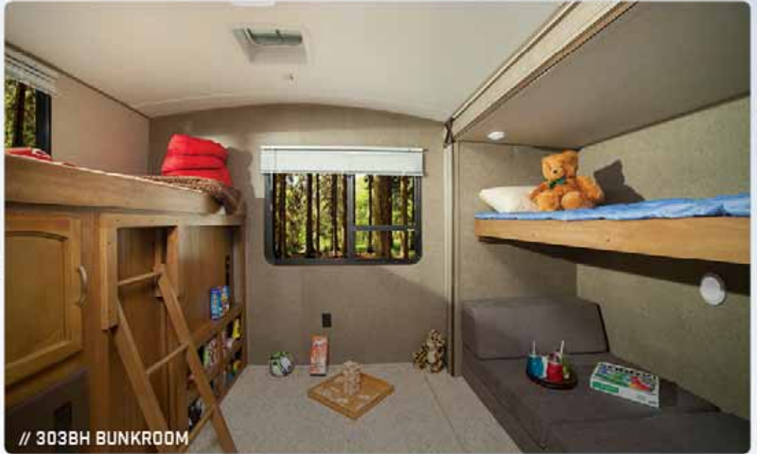
// 303BH BUNKROOM