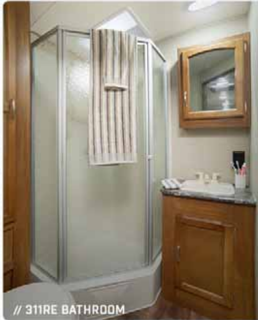
// 311RE BATHROOM