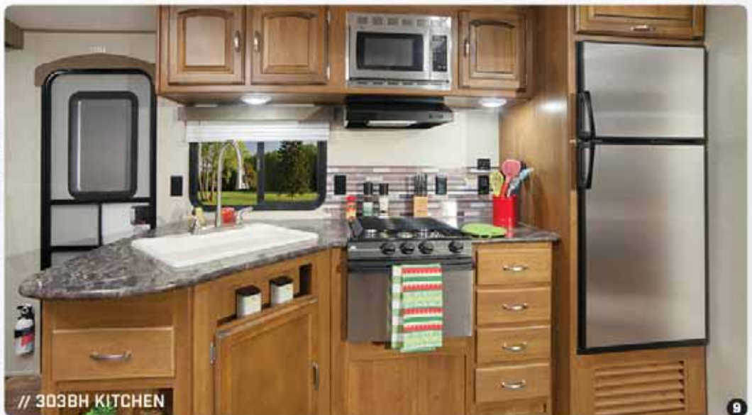
// 303BH KITCHEN