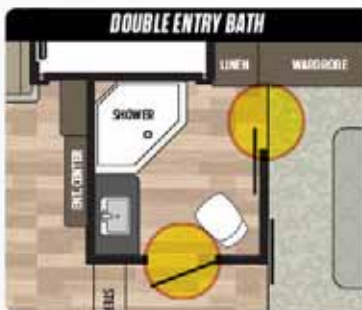
DOUBLE ENTRY BATH