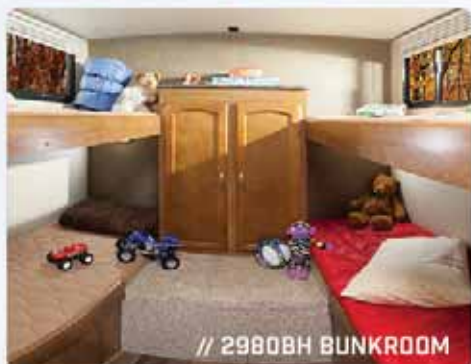
// 2980BH BUNKROOM