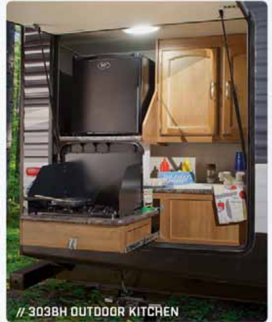
// 303BH OUTDOOR KITCHEN